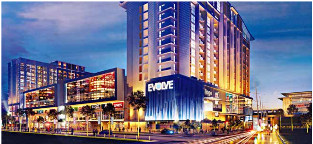
▼ Evolve Mall