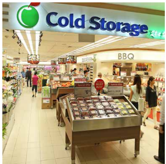
▼ Cold Storage