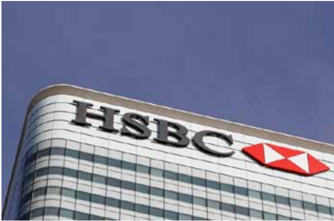
◀ HSBC Bank