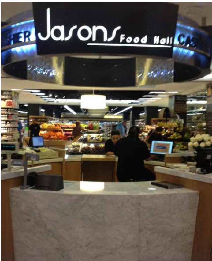
◀ Jasons Food Hall