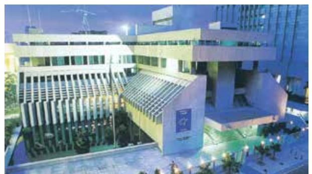
▲ Australia High Commissioner